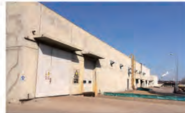
Vital Pigment Plant

Vital Pigments uses a specialized production process to transform raw Bismuth material into Bismuth Vanadate, allowing us to provide customers with high quality products at a cost-effective price.